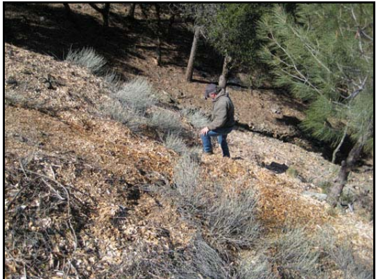
Drain location below light tunnel.

Water Bag Set-Up. Located on the southeast side of the building is the fire hydrant used for filling the water bag.